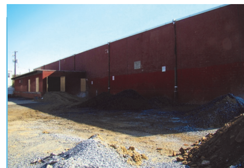
Construction has Begun